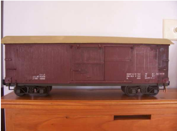
USA type Box Car with Curved Roof added.