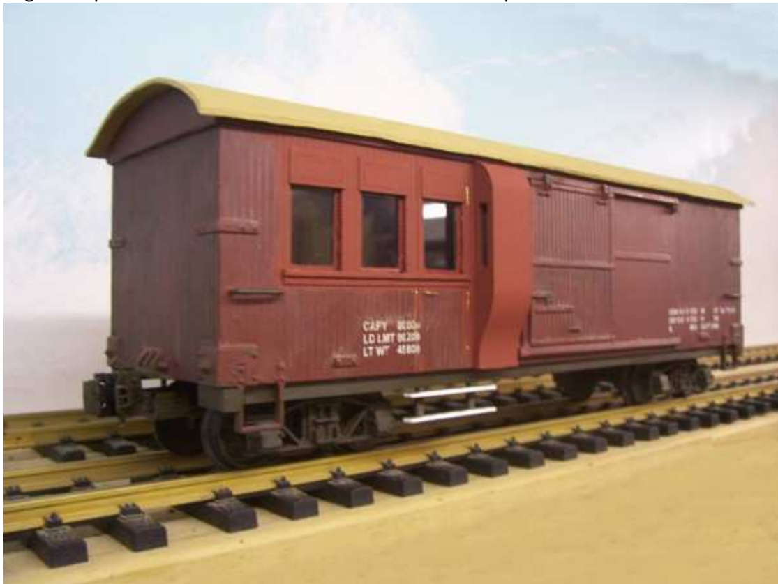
Geof's model of the BGG 601 completed.