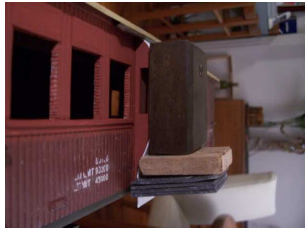
Look-Out sheathing being added.