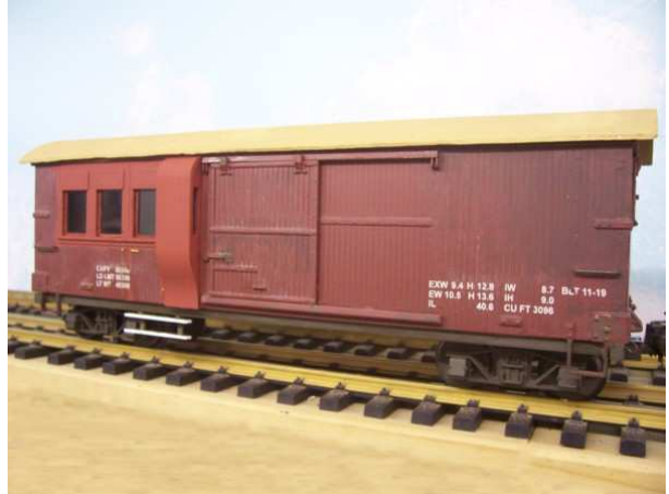
Goods compartment end.