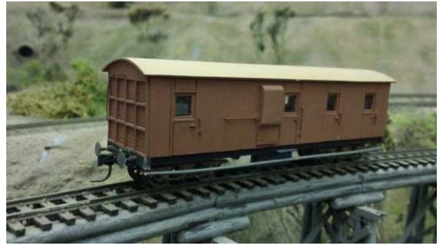
Common to all, is the Guards "Look-Out".