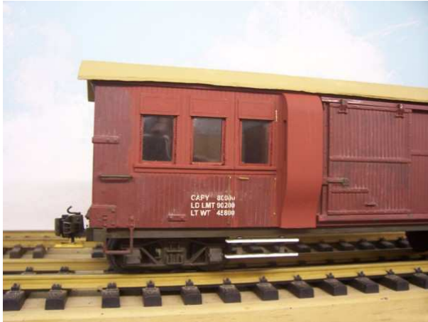
Passenger compartment end.