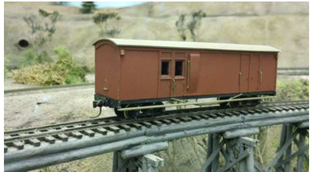
Modified a USA type Box Car changing the roof, adding windows, Passenger door & Guards Look-Out.