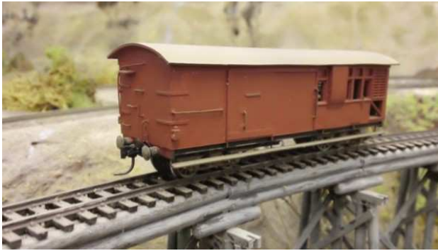
Some examples of the variability in side views.

Queensland Railways had a variety of Brake Vans in numerous configurations. The BTR has a freelance configuration that draws on the features of some of those.