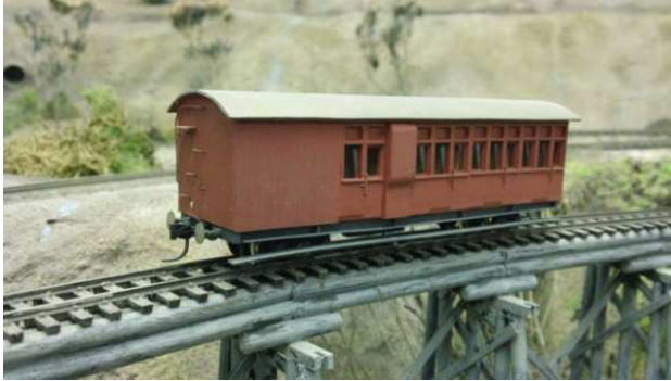
In some types the MIX of Goods to Passenger areas was adjusted for the likely service required.