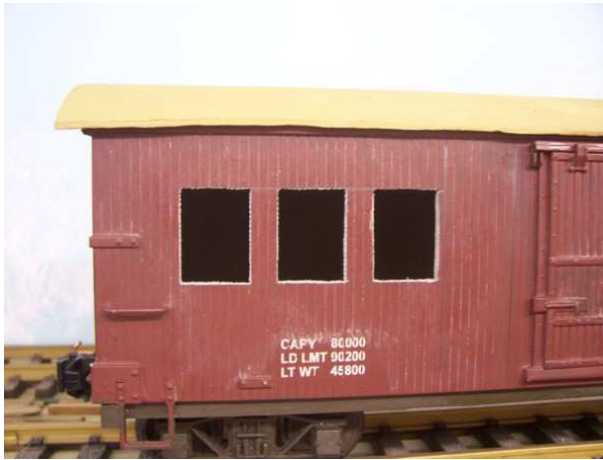
Window cut-outs prior to trim & glaze.